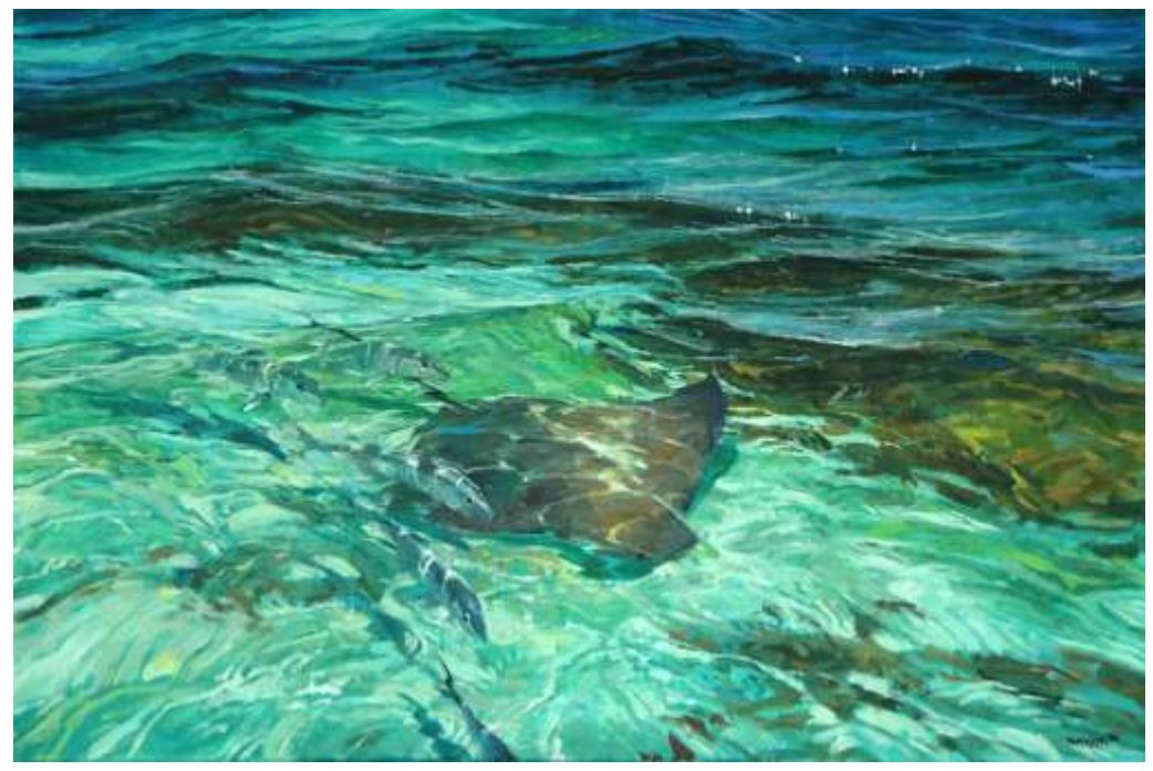
Meal Ticket, Al Barnes 2008, Oil, 30 x 40