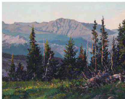
Trail Ridge View