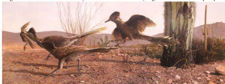
Greater Roadrunners & Canyon Towhee

Winner of the PleinAir Magazine Juror's Choice Award (Rocky Mountain National Park)