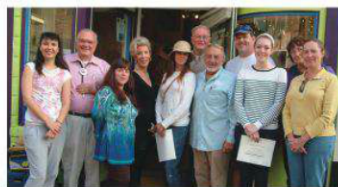
Participants in the event included (l-r)