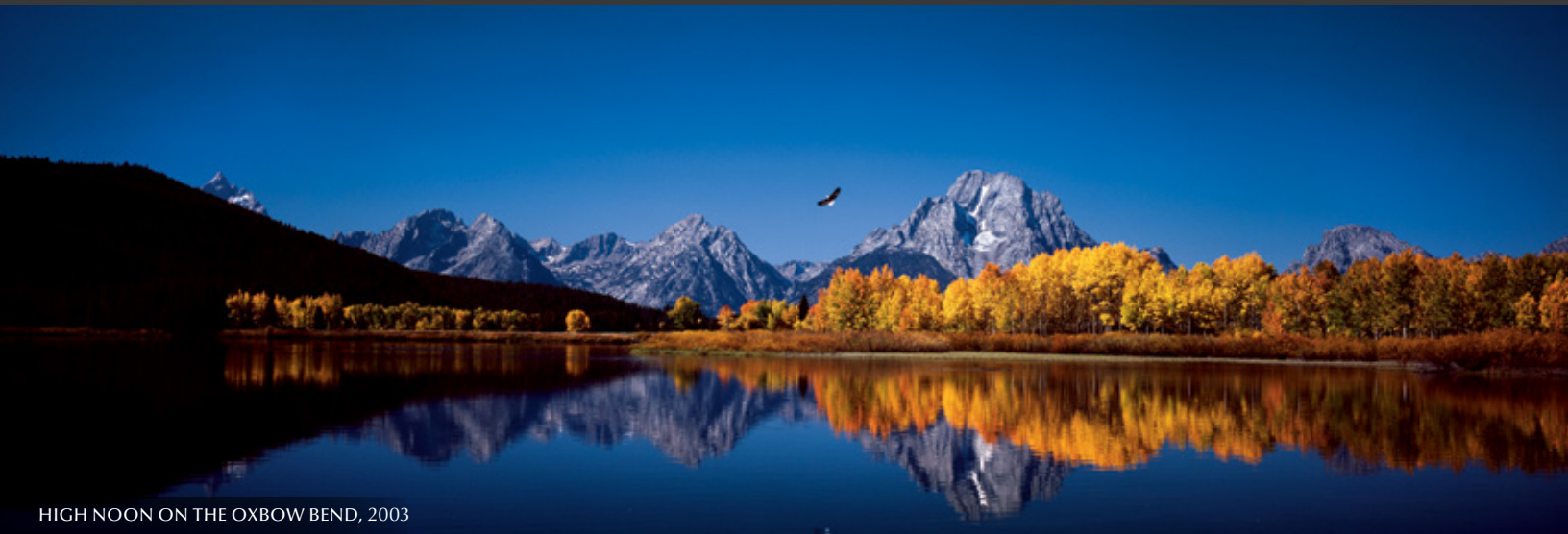
HIGH NOON ON THE OXBOW BEND, 2003