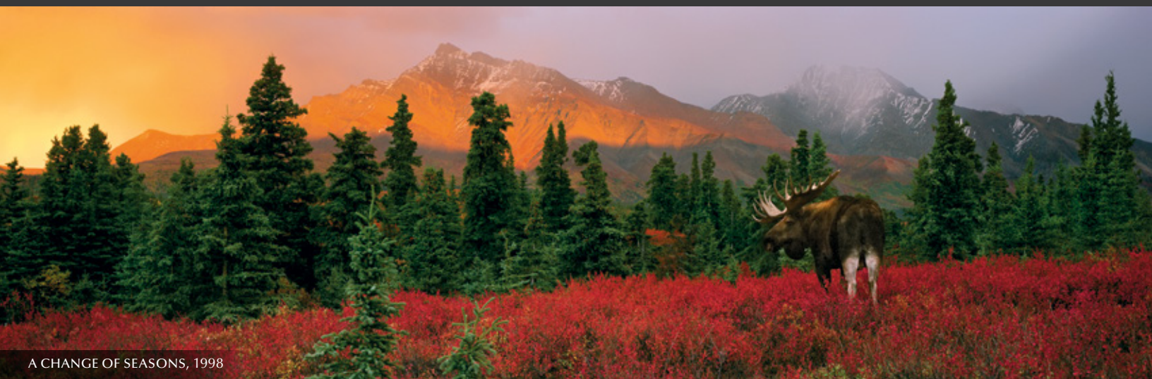
A CHANGE OF SEASONS, 1998